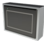
Premium control and touchscreen