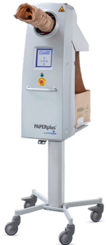
PAPERplus® Chevron 3