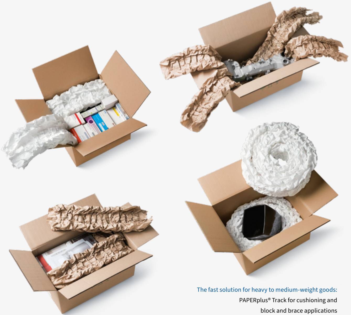
The fast solution for heavy to medium-weight goods: PAPERplus® Track for cushioning and block and brace applications