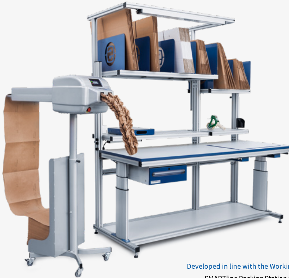
Developed in line with the Working Comfort® principle: SMARTline Packing Station with PAPERplus® Track