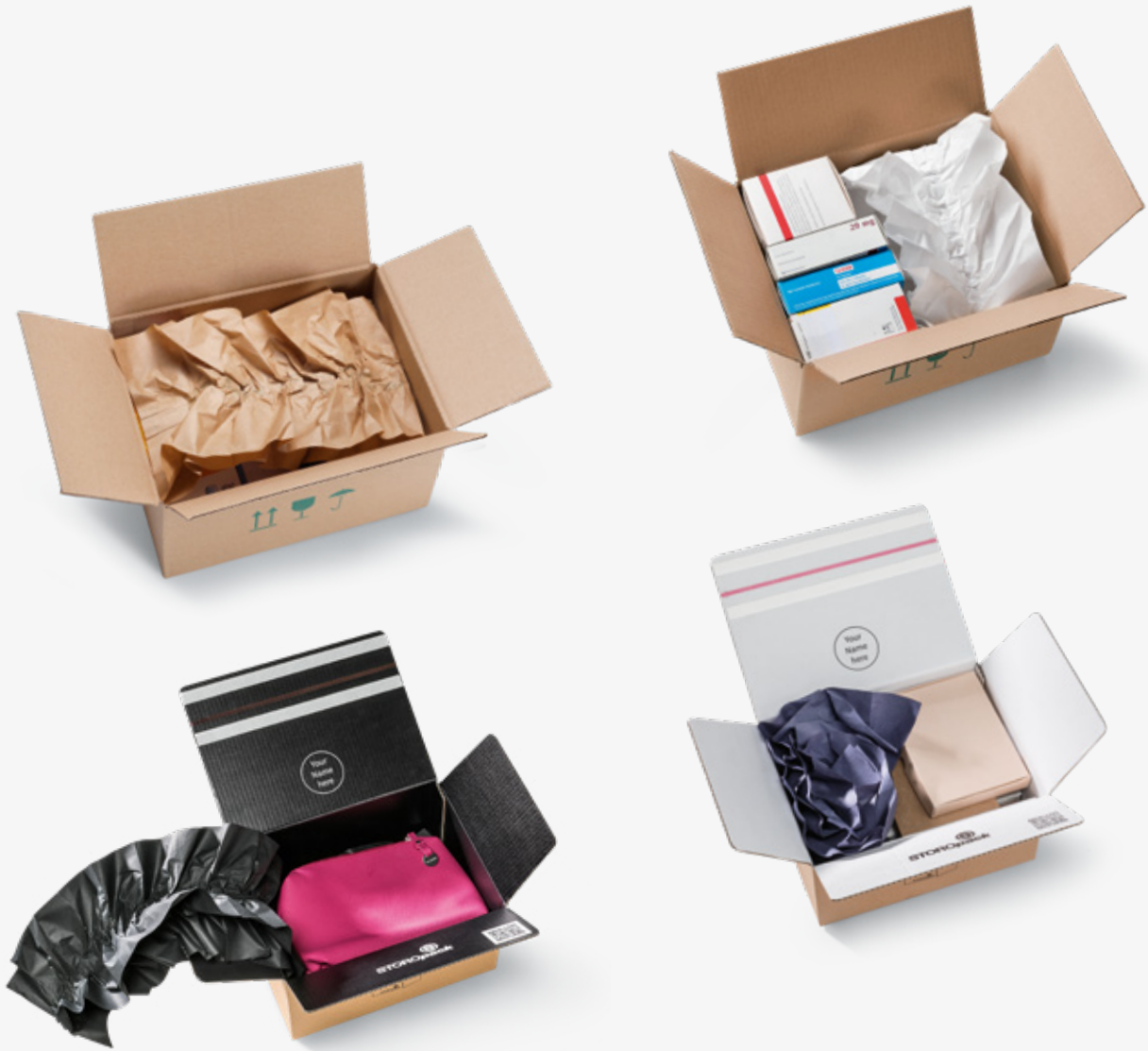
The compact solution for medium-weight to light items: PAPERplus® Papillon for void fill and wrapping