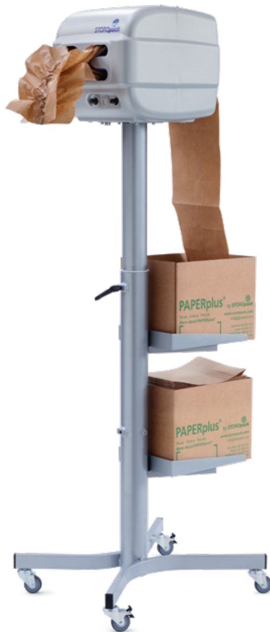
PAPERplus® Papillon Floor Stand Model

▶ PAPERplus® Papillon product video: www.storopack.com/paperplus-papillon-video