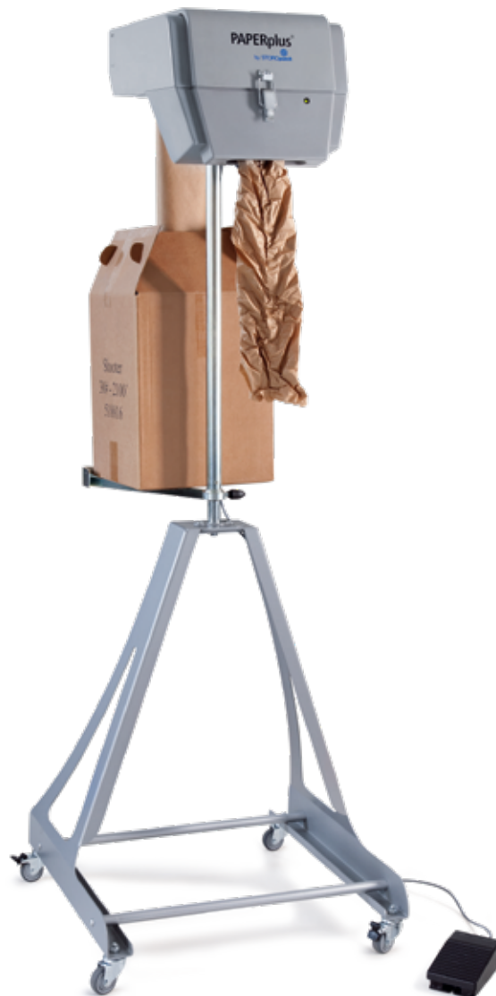
PAPERplus® Shooter Floor Stand Model